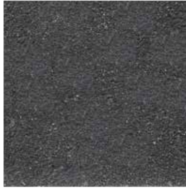
Wrought Iron Primer: 1500