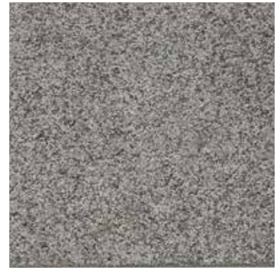
Coventry Gris Primer: Q-851