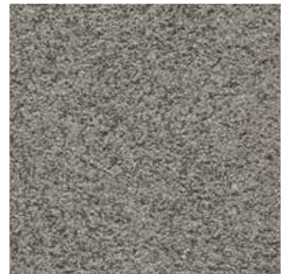
Rustic Taupe Primer: Q-851