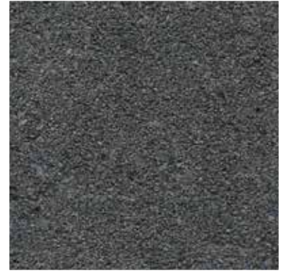
Noir Horizon Primer: 2017-3D