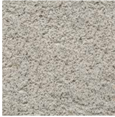
Blanca Peaks Primer: 2019-1L