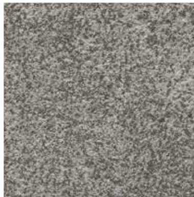
Silver Stone Primer: 2009-1L