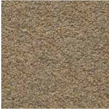
Sandy Wheat Primer: 2013-2M