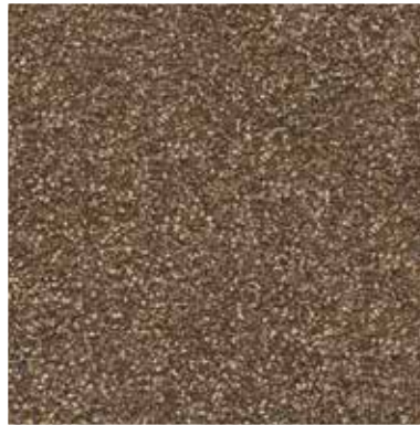
Spanish Chestnut Primer: 1003-3D