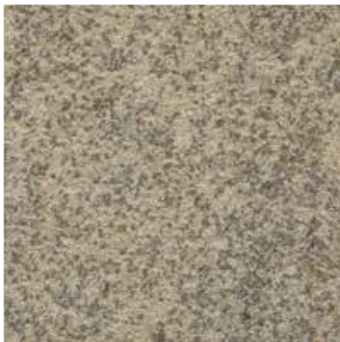
Mayan Tan Primer: 1013-1L