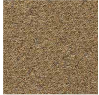
Nevada Sunset Primer: 1004-3D