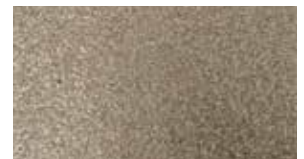
Trowel: TG-580H Broadcast: BG-580H