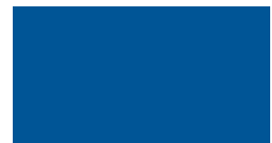
RAL5005 SF SIGNAL BLUE