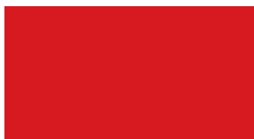
RAL3020 SF TRAFFIC RED