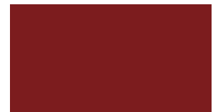
RAL3009 OXIDE RED