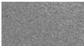
Trowel: TG-550E Broadcast: BG-550E