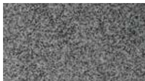
Trowel: TG-560F Broadcast: BG-560F