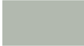
RAL7038 AGATE GREY