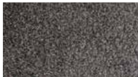
Trowel: TG-520B Broadcast: BG-520B