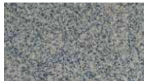
Trowel: TG-530C Broadcast: BG-530C