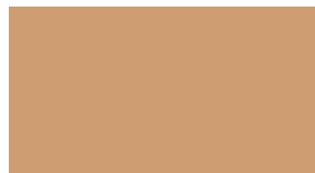
RAL1011 BROWN BEIGE