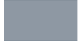
RAL7040 WINDOW GREY