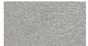
Trowel: TG-540D Broadcast: BG-540D