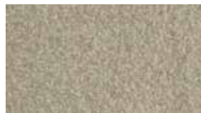
Trowel: TG-570G Broadcast: BG-570G