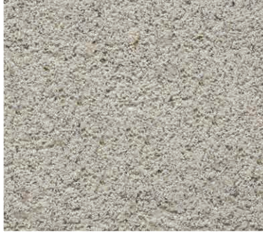
Blanca Peaks Primer: 2019-1L