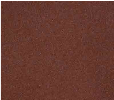
Brickstone Red Primer: DB2104