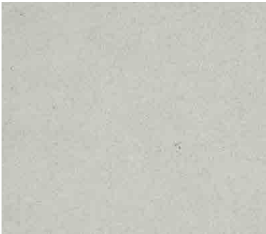
Diamond White Primer: 2015-1L