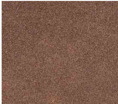
Adirondack Brown Primer: 1014-3D