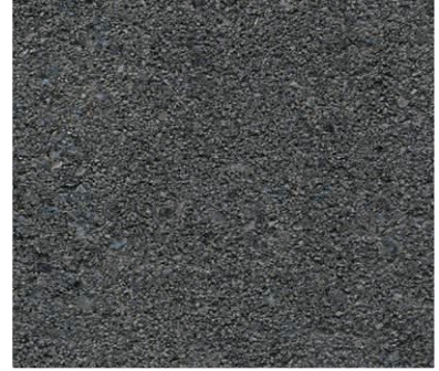
Noir Horizon Primer: 2017-3D