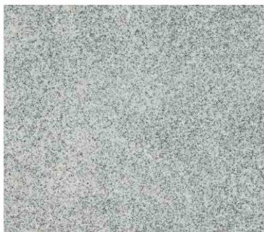
Silver Stone Primer: 2009-1L