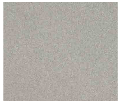
Smokey Taupe Primer: 23029