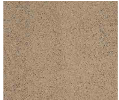
Nevada Sunset Primer: 1004-3D