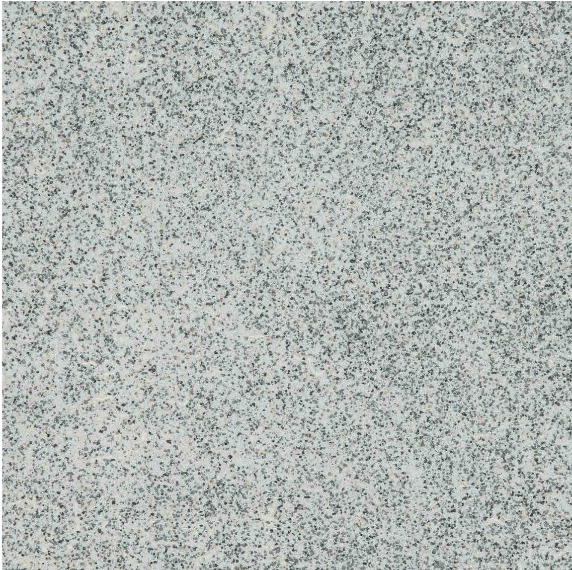
FEATURED COLOUR Silver Stone

Printed samples represent actual finish colours as closely as possible. Colour appearance may vary by texture, lighting and method of application. Always request a textured sample before ordering.