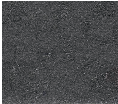
Wrought Iron Primer: 1500