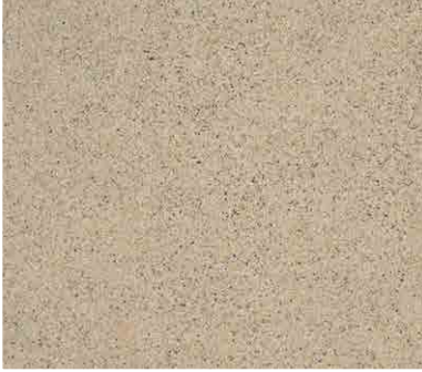
Sandy Wheat Primer: 2013-2M